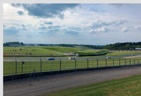
Trackside view at Coppice

Please see map on reverse for entry and parking locations.