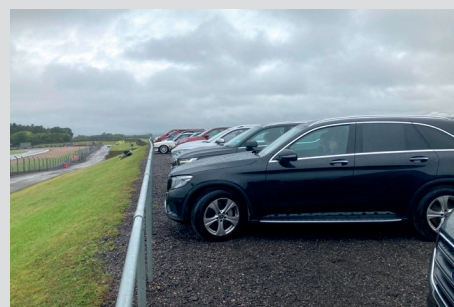
Hard surface parking at Coppice

Please note: At Grade D (smaller, club-level) events ALL parking is accessible through the main entrance only. For a list of Grade D events please visit www.msv.com .